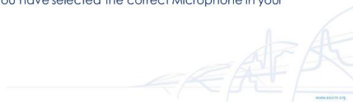
Figure 3: Tips for Microphone and Camera troubleshooting