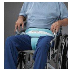
Belt in Chair